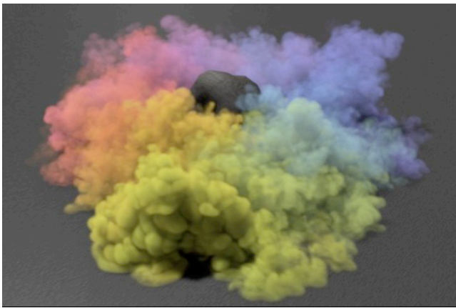
Figure 1 RGB Color Volume

Jihyun Yoon DreamWorks Animation yoonji1@hotmail.com