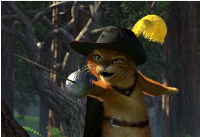
Fig 1: Puss in Boots

The feather's coarse simulation is designed to run quickly and produce stable, predictable results. The procedural animation, computed at render-time, oscillates the individual barbs of the feather.