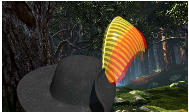
Fig 2: Yellow Feather Surface and Red Ghost Surface

The amplitude is proportional to the distance between the two surfaces. The ghost surface is simulated at the same time as the feather surface, using nearly the same dynamics. We eliminate stretching by using a reference surface to determine the length of each barb.